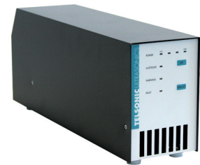
Table top version