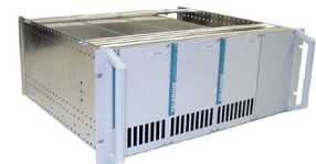
Modular design for 19" - housing